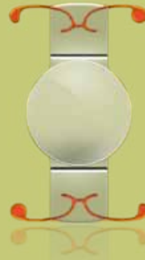
Crystalens® Nomogram For Short Eyes